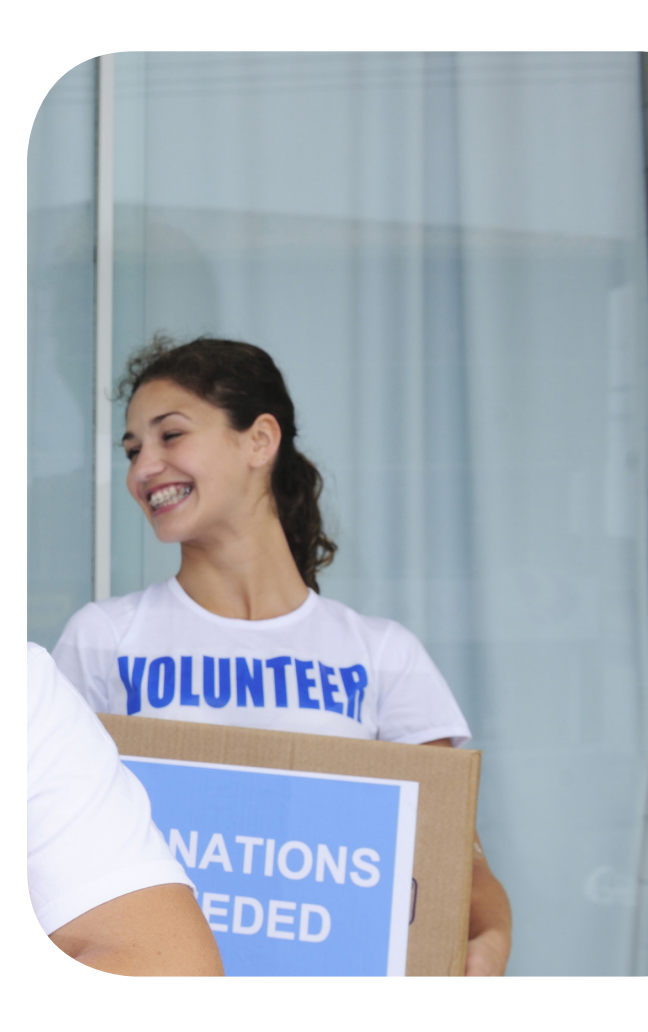
Fellowship Travel International